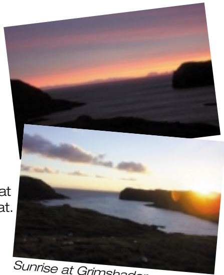
Sunrise at Grimshader

If you enjoy 'wild' then this is for you!