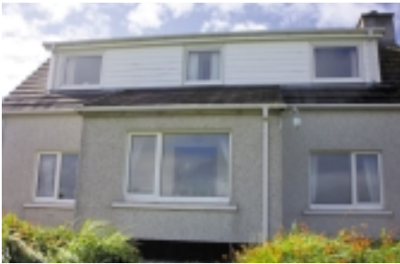
Seaview from the front