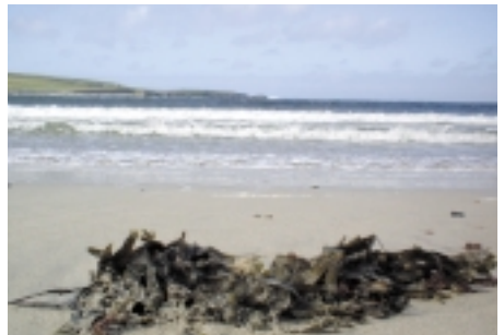
A Westside beach