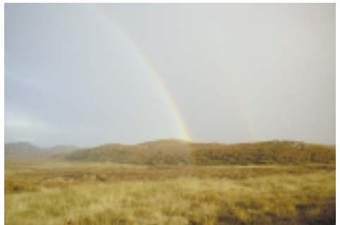
Open moorland on the way to Seaview

Heading south on the A859 you head out of Stornoway for a couple of miles watching for the left turn that takes you to Grimshader.