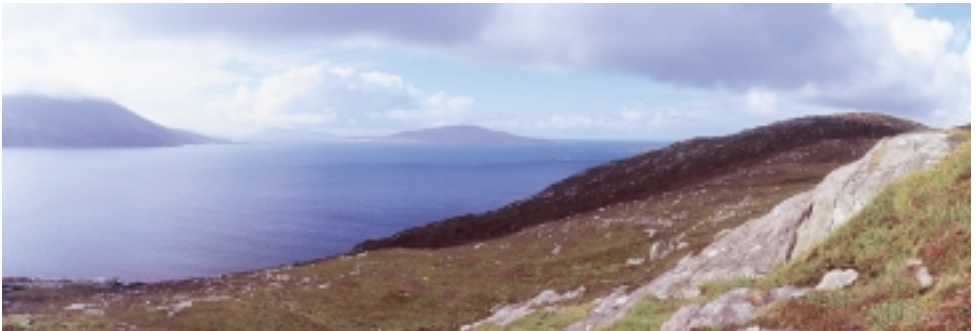
Taransey from Harris