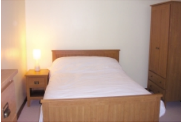
Ground floor double bedroom furnished in the Shaker style.

This bedroom will have an ensuite fitted with WC, basin and shower during early 2006.