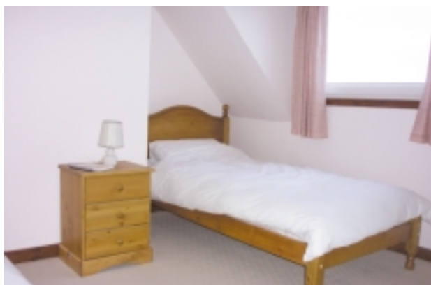
Upstairs twin bedroom also in pine with draw units and built in wardrobe.