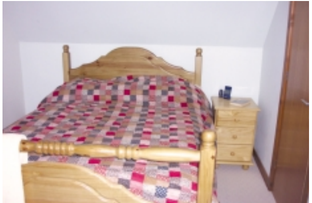
Upstairs double bedroom is a very cosy room finished in pine with draw units and built in wardrobe.

This bedroom will have an ensuite fitted with WC, basin and shower during early 2006.