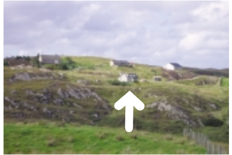
Seaview from the other side of the loch