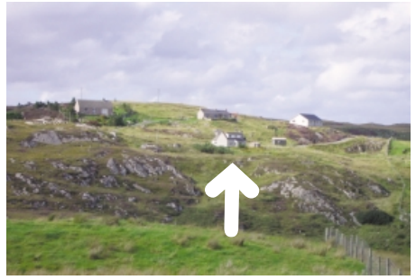
Seaview from the other side of the loch