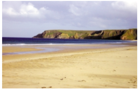
Clean, fresh sands at Traigh Mhor beach (Tolsta - east side)