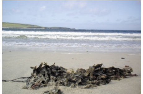
A westside beach