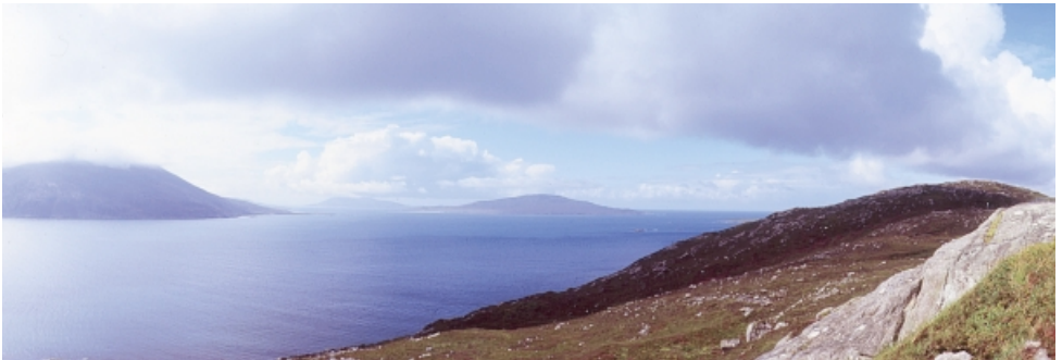
Taransey from Harris