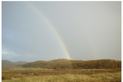
Open moorland on the way to Seaview

Heading south on the A859 (Tarbert and Harris) out of Stornoway for a couple of miles watching for the left turn that takes you to Grimshader.