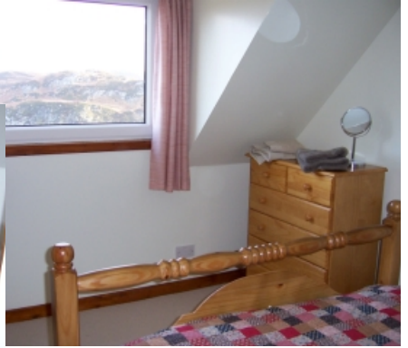
Upstairs twin bedroom also in pine with draw units and built in wardrobe.