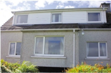
Seaview from the front