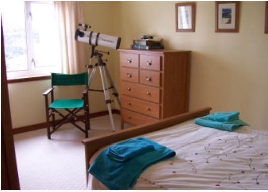
Ground floor double bedroom furnished in the Shaker style.