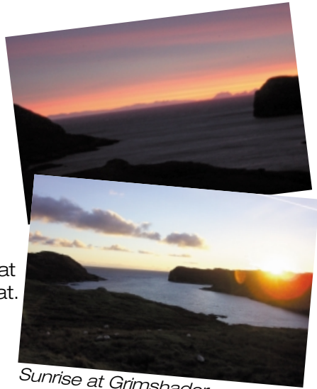
Sunrise at Grimshader

If you enjoy 'wild' then this is for you!